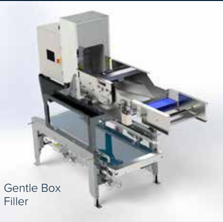
Gentle Box Filler

It is available in weighing and non-weighing configurations that determine how each pack is created. Non-weighing is best to achieve maximum pack-out and traceability and weighing is best for achieving high pack rates. This product also supports automated transfer of packaging through filling cycle.