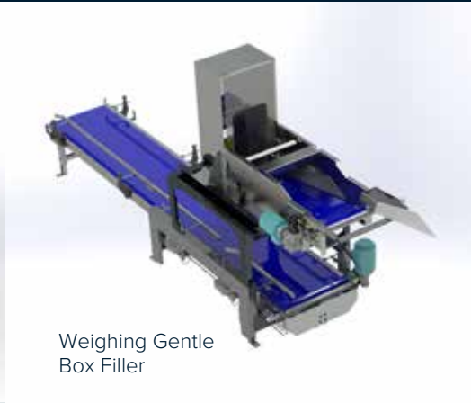
Weighing Gentle Box Filler